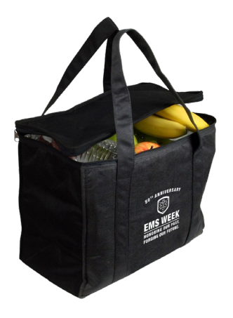
RECYCLED P.E.T. COOLER BAG minimum order: 25 pieces Starting at $12.49