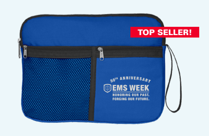
MULTI-PURPOSE CARRYALL $6.99