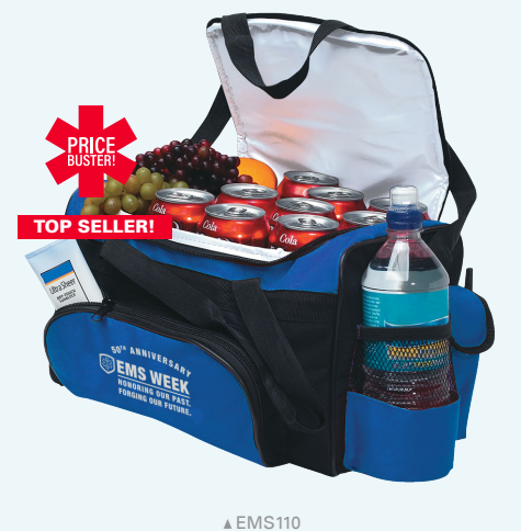
JUMBO COOLER $19.99