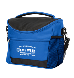
TAKE IT-TO-GO LUNCH COOLER minimum order: 40 pieces Starting at $23.99