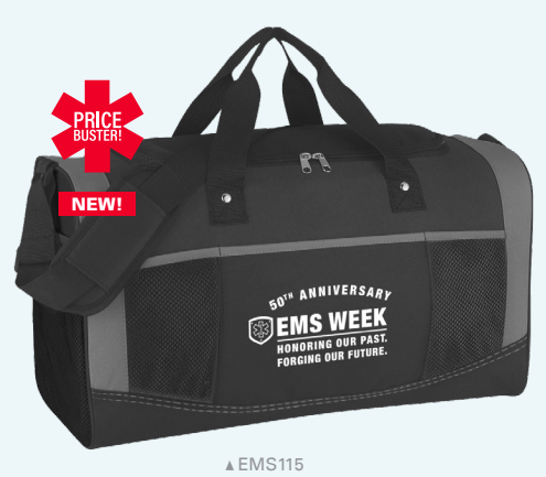
WEEKEND DUFFEL $23.99