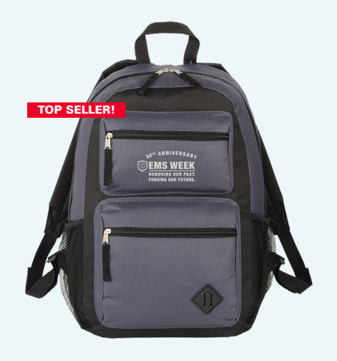
▲ EMS114 DOUBLE POCKET BACKPACK $19.99