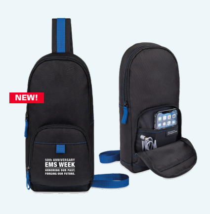
▲ EMS113 SLING BAG $16.99