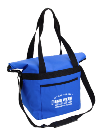
WATERPROOF COOLER BAG minimum order: 30 pieces Starting at $22.99