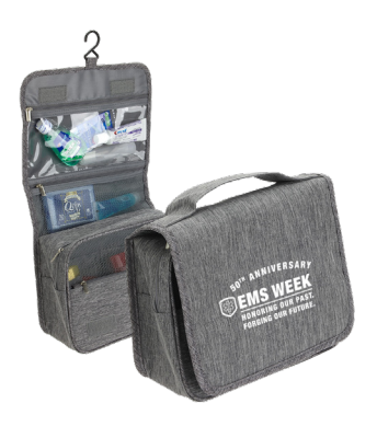
TOILETRY BAG minimum order: 25 pieces Starting at $16.99