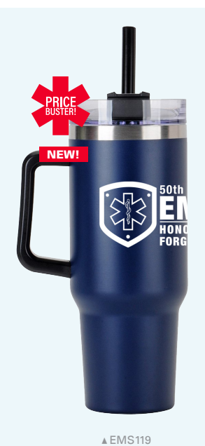
THIRSTY TRAVELER VACUUM INSULATED TUMBLER $26.99