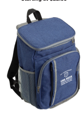
DELUXE COOLER BACKPACK minimum order: 25 pieces Starting at $27.99